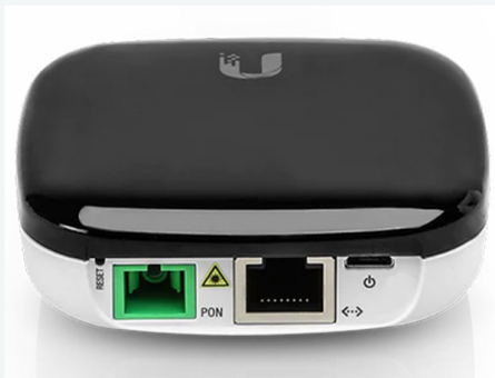
Ethernet wall port